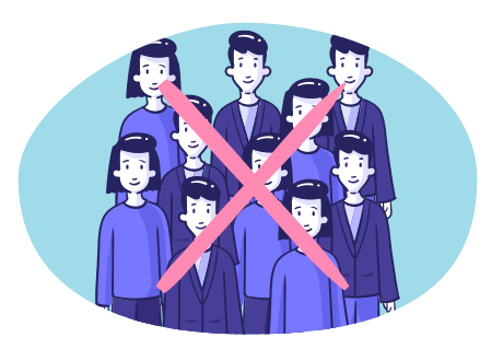
Avoid unnecessary physical contact