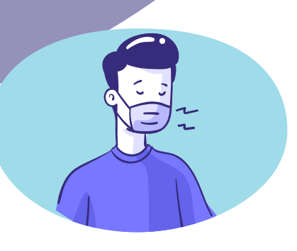
Use protective equipment