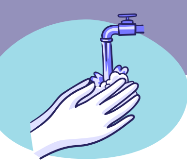
Wash and/or disinfect your hands regularly