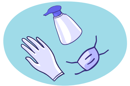
If it is not possible to keep a sufficient distance, follow the instructions for appropriate protective and cleaning equipment