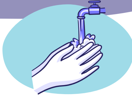
Wash your hands thoroughly and regularly