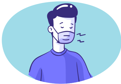
Wear protective equipment and also provide disinfectant at the entrance(s) to the property