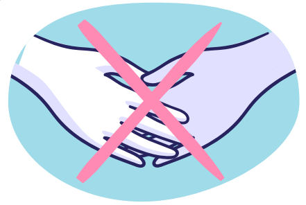
Don't shake hands