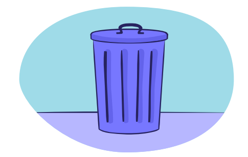
Provide a sealable waste bin in the access area