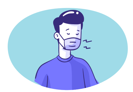
Wear protective equipment and also always provide disinfectant