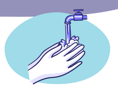
Wash your hands thoroughly and regularly